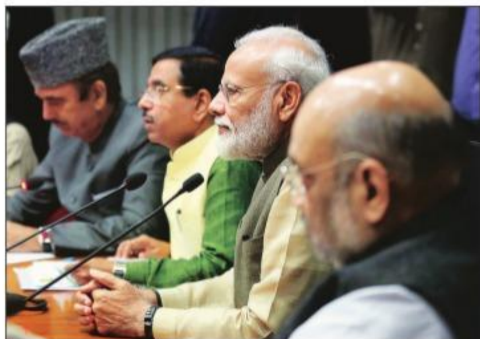
Modi, Shah, Azad at the all-party meeting, Sunday.

Returning to power with an increased majority, the Modi government in the past two sessions pushed through the triple talaq Bill and the scrapping of special status to Jammu and Kashmir. Now, bolstered by the Supreme Court verdict in the Ayodhya case, it has lined up exhaustive legislative business