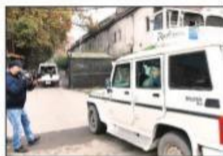
The detainees being moved in Srinagar on Sunday.

The Peoples Democratic Party (PDP) claimed that the hostel wasn't equipped with heating facilities, the reason unofficially given for shifting the detainees. This led to protests, after which