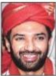
TDP, RLSP left earlier: LJP chief