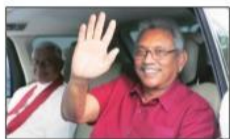
Gotabaya Rajapaksa after the results, in Colombo.

BY THE time friends and family members started thronging his two-storey house, away from the heart of Colombo, the verdict was clear. Around noon Sunday, visitors were told that he was taking a nap after staying up the entire night to track the results. Finally, in the afternoon, Gotabaya Rajapaksa stepped out to reach the election commission.