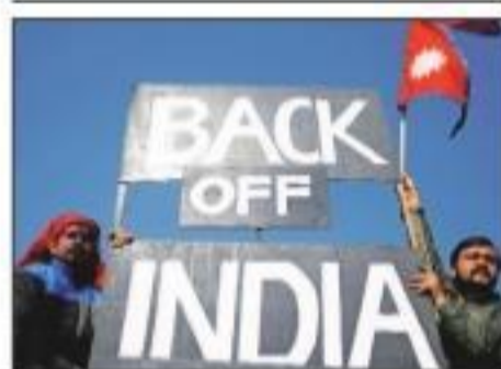
INDIA MAPS: NEPAL PM SAYS KALAPANI ITS AREA, PAGE 13